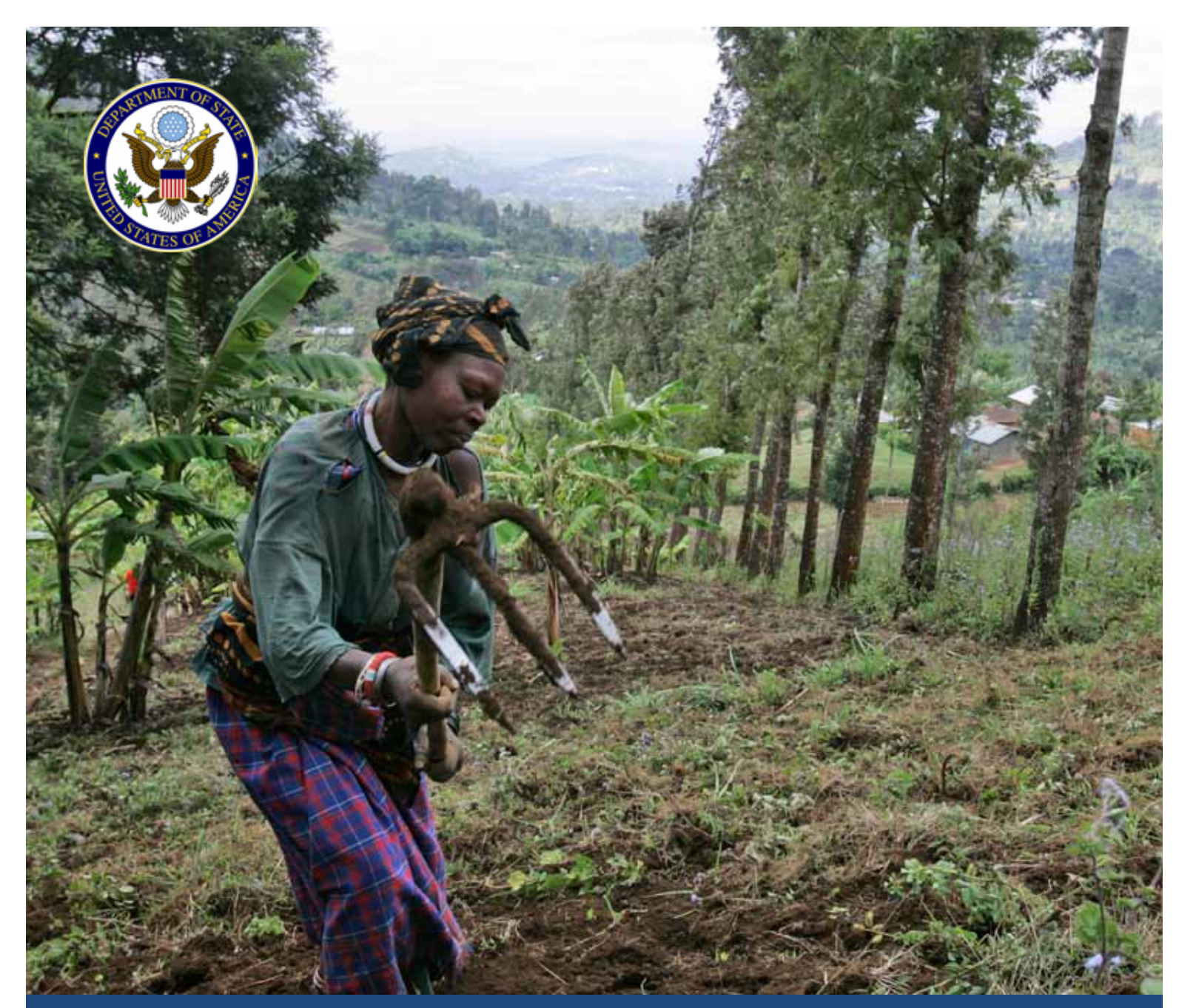
A farmer works in the field in Ngiresi, Tanzania.

For more information on some of the programs you have read about in this brochure, please visit: USAID.gov or FeedtheFuture.gov.