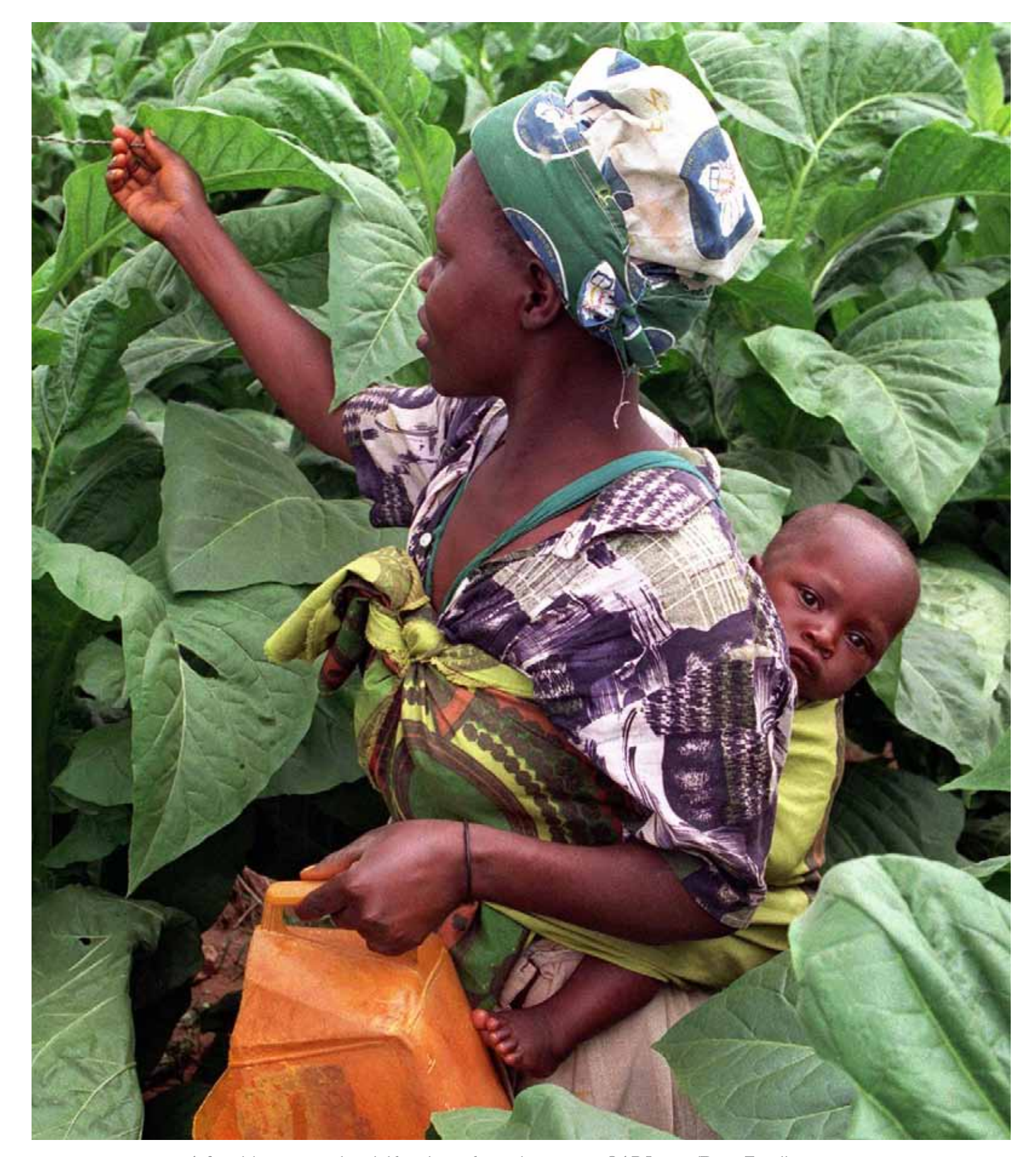
A farm laborer carries her child as she tends to tobacco crops.