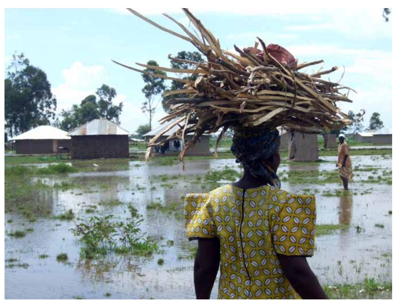
A woman carrying firewood on her head wades through the flood waters after the river Sondu Miriu burst it's banks following a heavy downpour in Kisumu in the southern part of Nyanza, Kenya.

In Senegal's southern forest zone, USAID supported Boubou Deme, a producers' organization comprised of 22 producers, including 17 women. Before this, Nimna Diayte, president of the producer group, generated meager yields of one ton per hectare of maize due to poor seeding practices and poor seed quality and earned less than $2,000 per year. In 2010, with support from USAID, Nimna was able to buy quality seeds for the first time and doubled her field size to 4.5 hectares. That year, she harvested 13 tons (2.9 tons per hectare) and almost tripled her income. In 2011 she planned to plant 10 hectares and hopes to increase her income yet again.